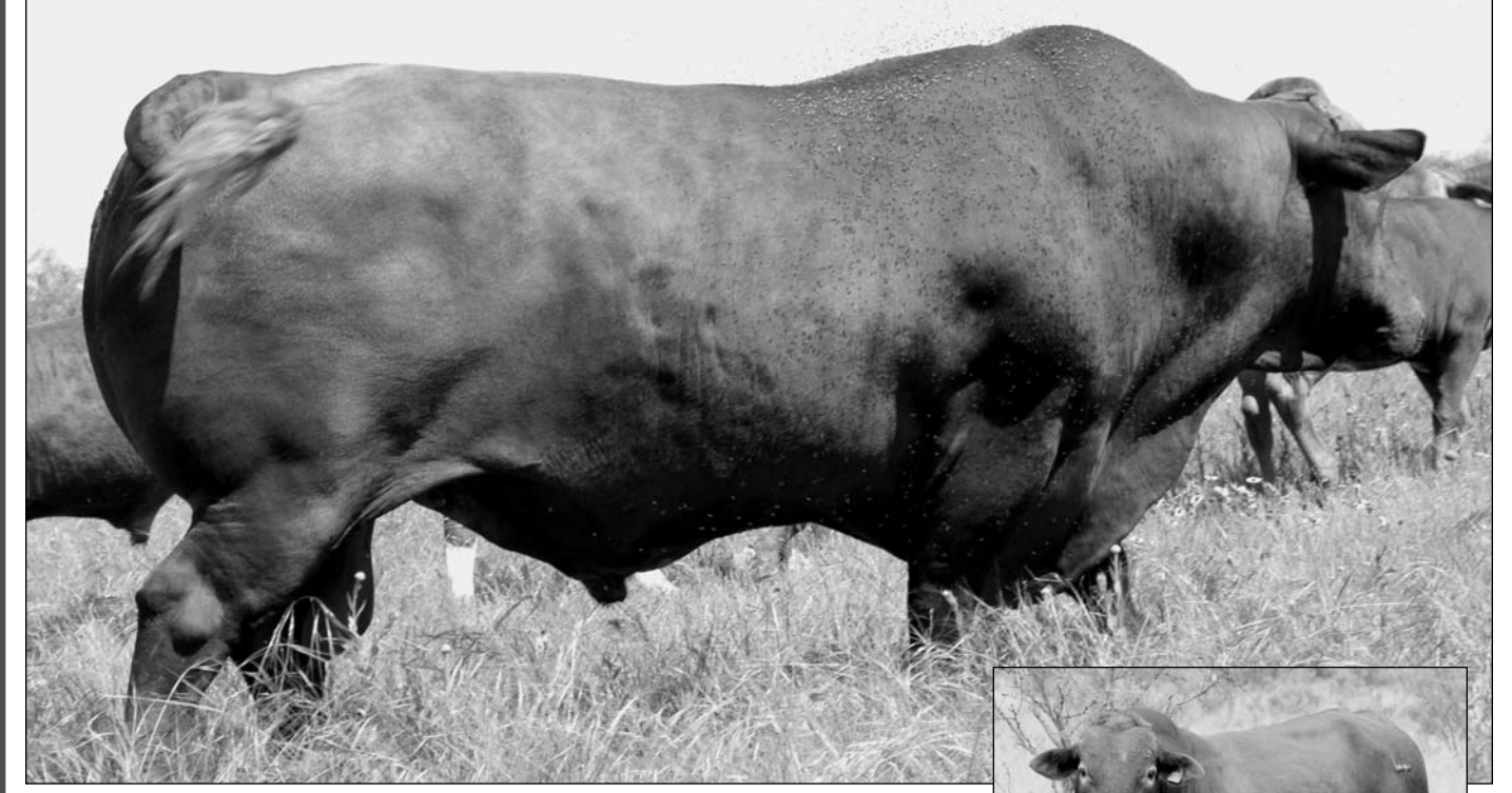
Unretouched range photographs

Ted Cain, Cain Cattle Co., upon seeing 5-48 October 7, 2010 — "I hope he bred them all" (referring to the females Ted purchased)